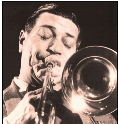
Just Jazz Artist of the Month trombonist Jack Teagarden