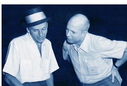
Frank and Jimmy Van Heusen