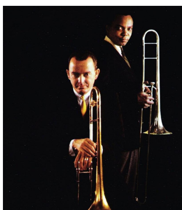
7/9: The Annual Just Jazz/Sinatra Hour All-Trombone Special

From June through August, during Hour Three of Just Jazz (noon-1:00), I'm counting down the 100 Most Frequently Recorded Jazz Standards as compiled by the excellent website, jazzstandards.com .