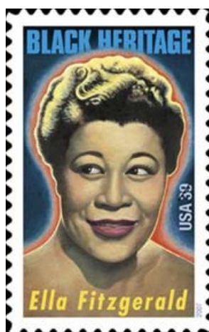
2017 marks the 100th birthday anniversary of the great Ella Fitzgerald. And so, I am celebrating Ella and her music all year long on Just Jazz featuring The Sinatra Hour .

Just Jazz featuring The Sinatra Hour is heard every Sunday from 10:00 a.m. to 1:00 a.m. Eastern Time (US) over WRNJ 104.7 & 92.7 FM and 1510 AM and streaming worldwide at tunein.com/radio/WRNJ