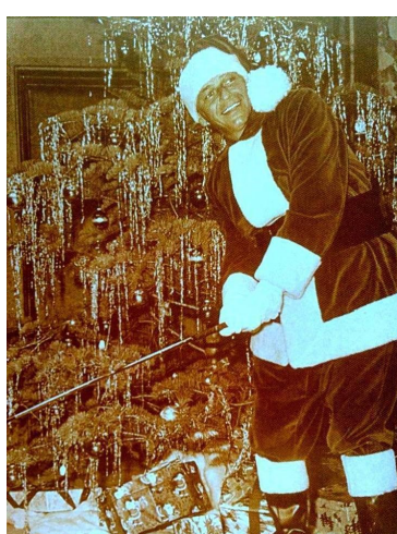
Frank and I wish you a swingin’ holiday!

12/10: A Sinatra Retrospective (Hour 2) and A Jazz Tribute to Frank Sinatra (Hour 3) Christmas Eve: The Annual Just Jazz “Cool Yule” Special New Year’s Eve: Count Basie and the Great Singers (Hour 2) and Songs of Winter (Hour 3)